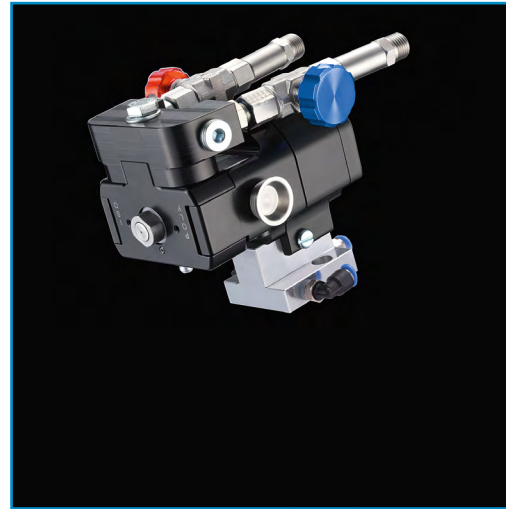
WIWA PU GUN 4040 automatic gun

With the development of the WIWA PU GUN 4040 , we are expanding our wide range of innovative PU application technology with our own spray gun.