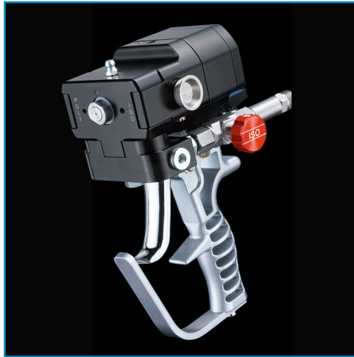
WIWA PU GUN 4040 manual gun