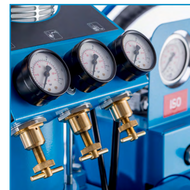
User friendly control