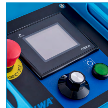
Innovative interface with easy operation